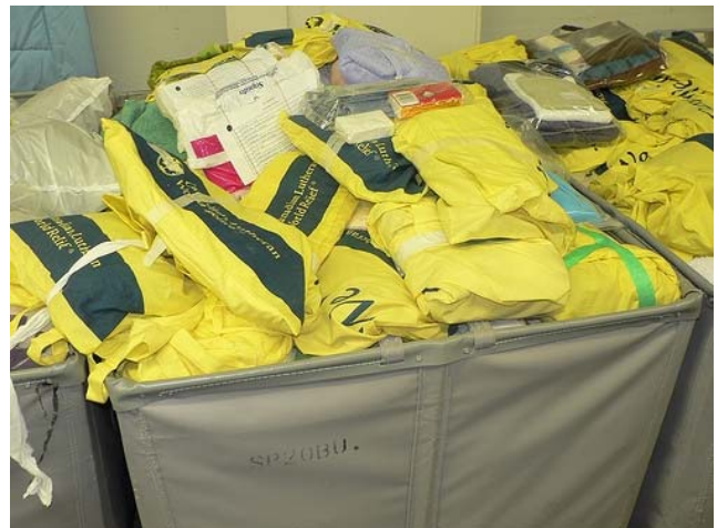
We Care kits waiting to be inspected and repacked at CLWR's Winnipeg warehouse.

To see evidence of the extent to which Lutherans in Canada have embraced Canadian Lutheran World Relief's We Care program, all one need do is visit our King Edward Street warehouse in Winnipeg. Over the past two months, approximately 3,000 kits have arrived and the warehouse, which looked semi-barren in early October after a shipment to Malawi was loaded, is beginning to fill up again.