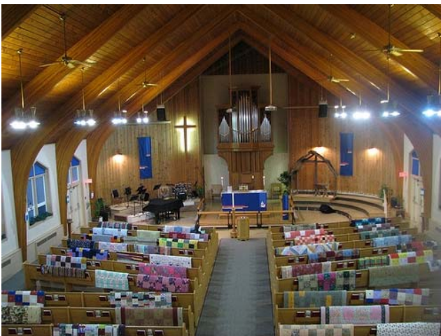
Messiah Lutheran, Camrose, Alberta sanctuary decorated with quilts for CLWR Sunday.

Since September, the Messiah ELW has completed 95 quilts and afghans that will be forwarded to CLWR and the Lutheran Association of Missionary Pilots (LAMP). To learn more about CLWR's We Care quilts and kits program of CLWR, please visit www.clwr.org/what-we-do/ .