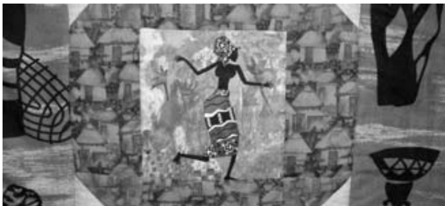
All Saints Lutheran quilt incorporates fabric from Cameroon, Africa.