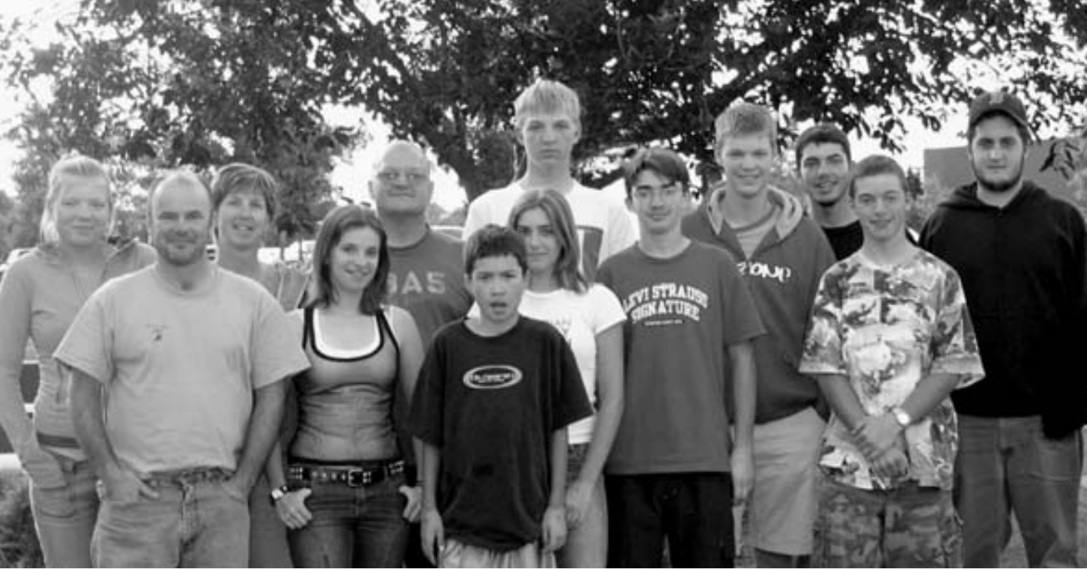
These cyclists from All Saints Lutheran in Ottawa spent the better part of a year raising funds and preparing for their 4,900 kilometre trip.