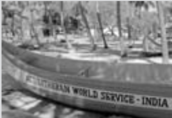
Rebuilding livelihoods and houses.

CLWR's partners continue to help victims of the tsunami disaster and are now building permanent houses in villages along the devastated southeastern coastal region of India. The United